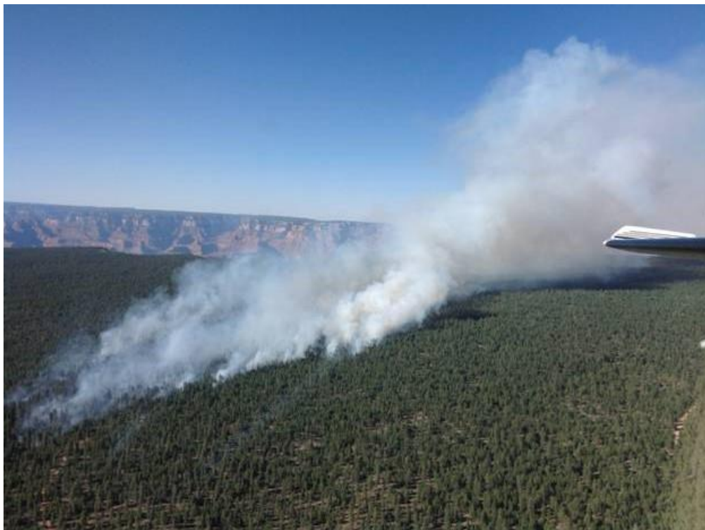
Halfway Fire burning east of Tusayan, AZ as taken by air tanker personnel.