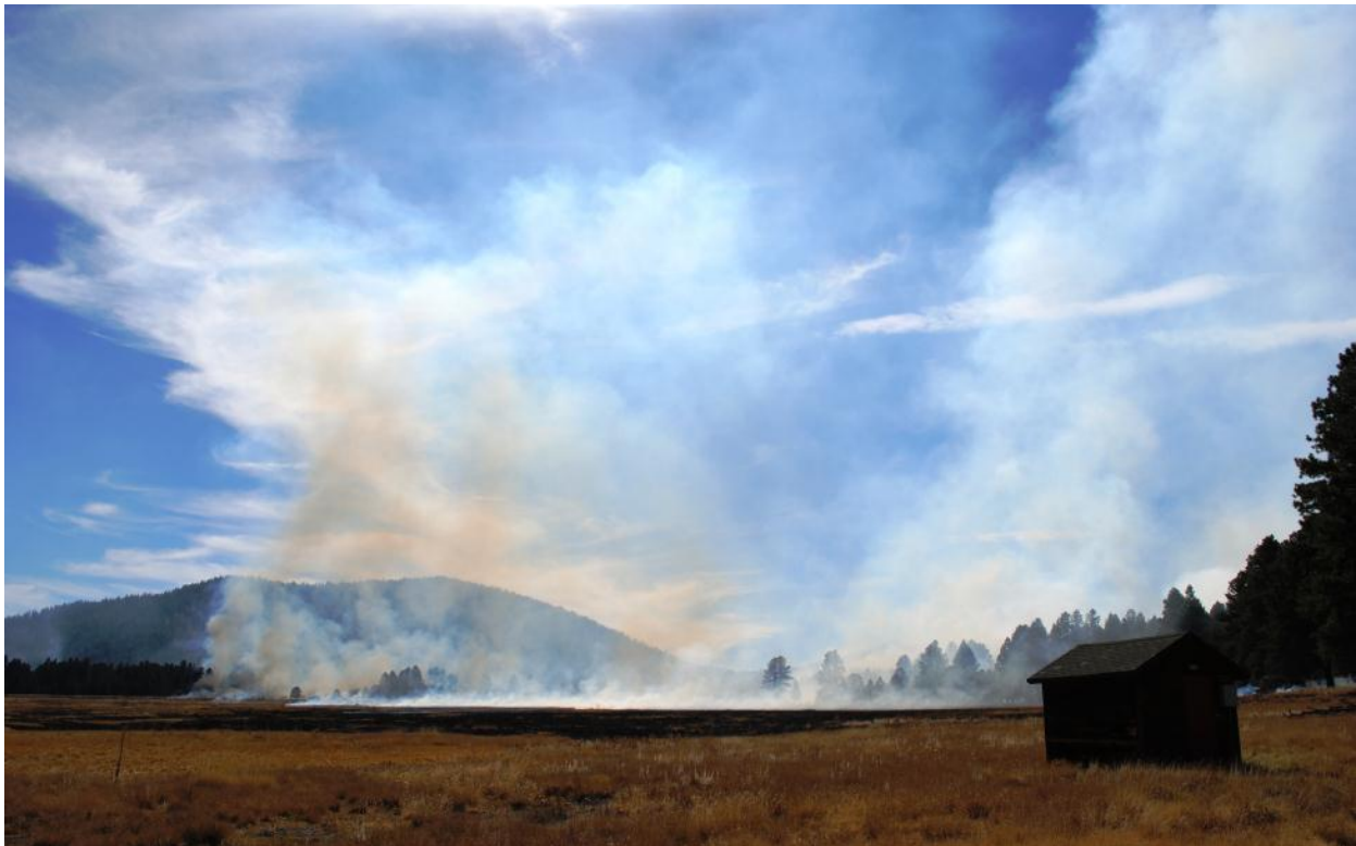
Smoke from grass ignitions on the Spring Valley Rx quickly dissipates in October 2013 on the Williams Ranger District.