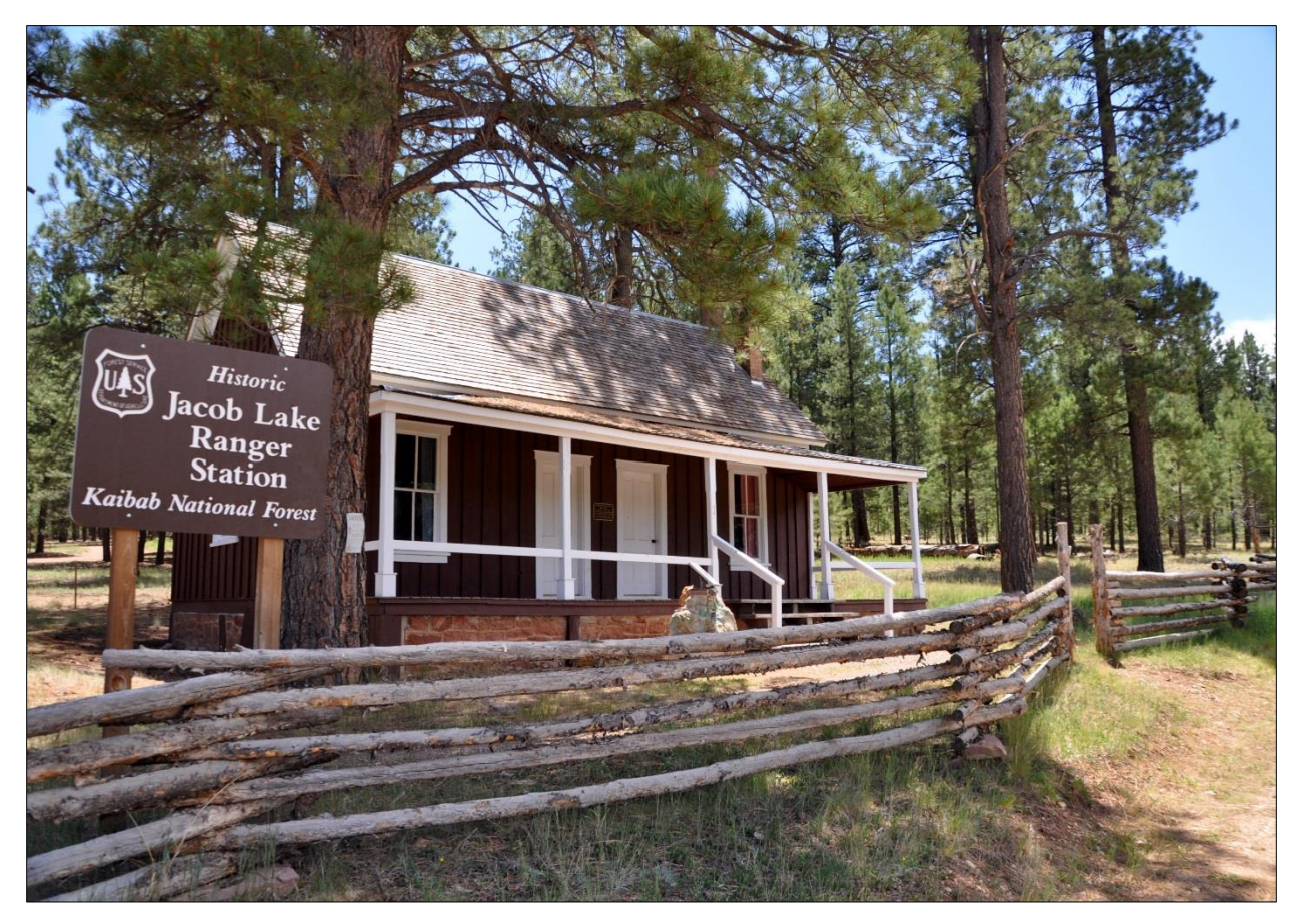
Jacob Lake Ranger Station on the North Kaibab Ranger District of the Kaibab National Forest.