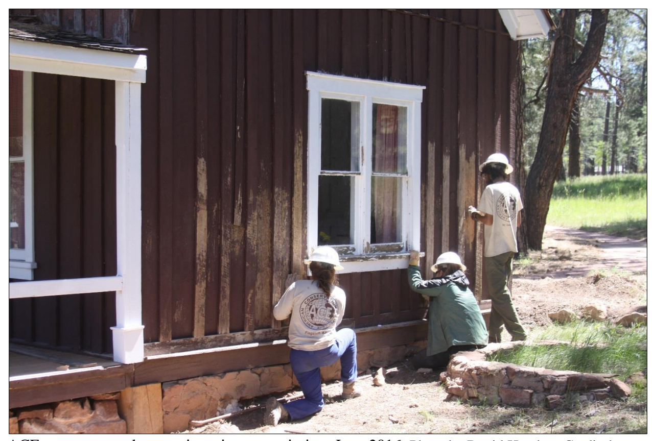
ACE crew scrapes loose paint prior to repainting, June 2016.