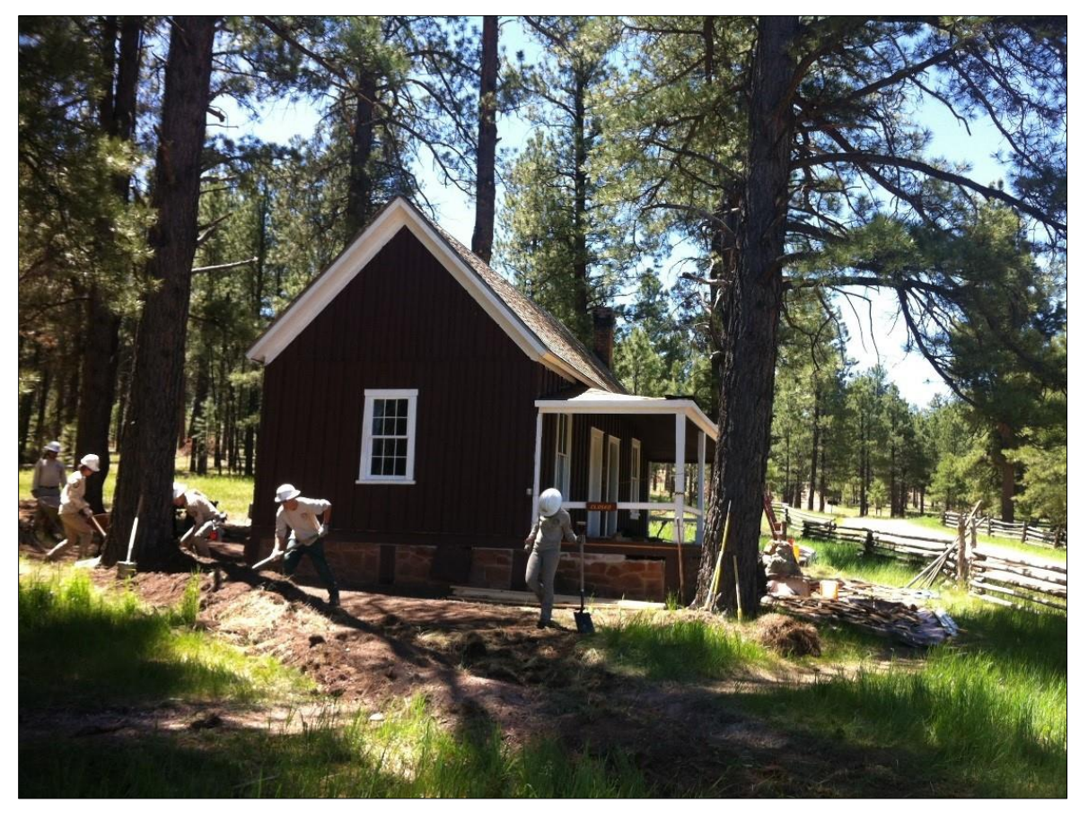
ACE crew cleans out and expands drainage ditches during the Jacob Lake Ranger Station cabin restoration project, June 2016.