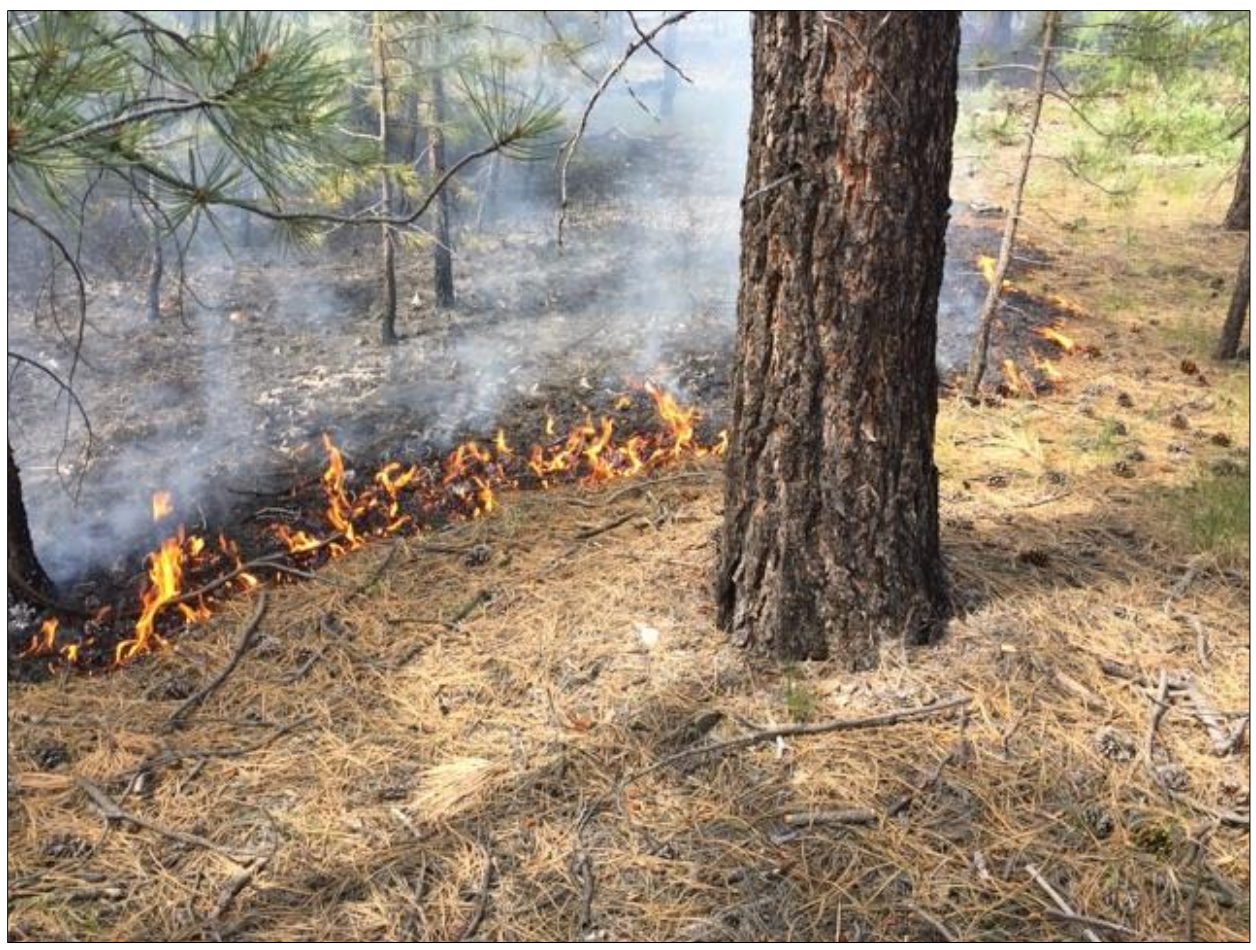
Low intensity Burnt Fire consuming pine litter yesterday, July 7, 2015.