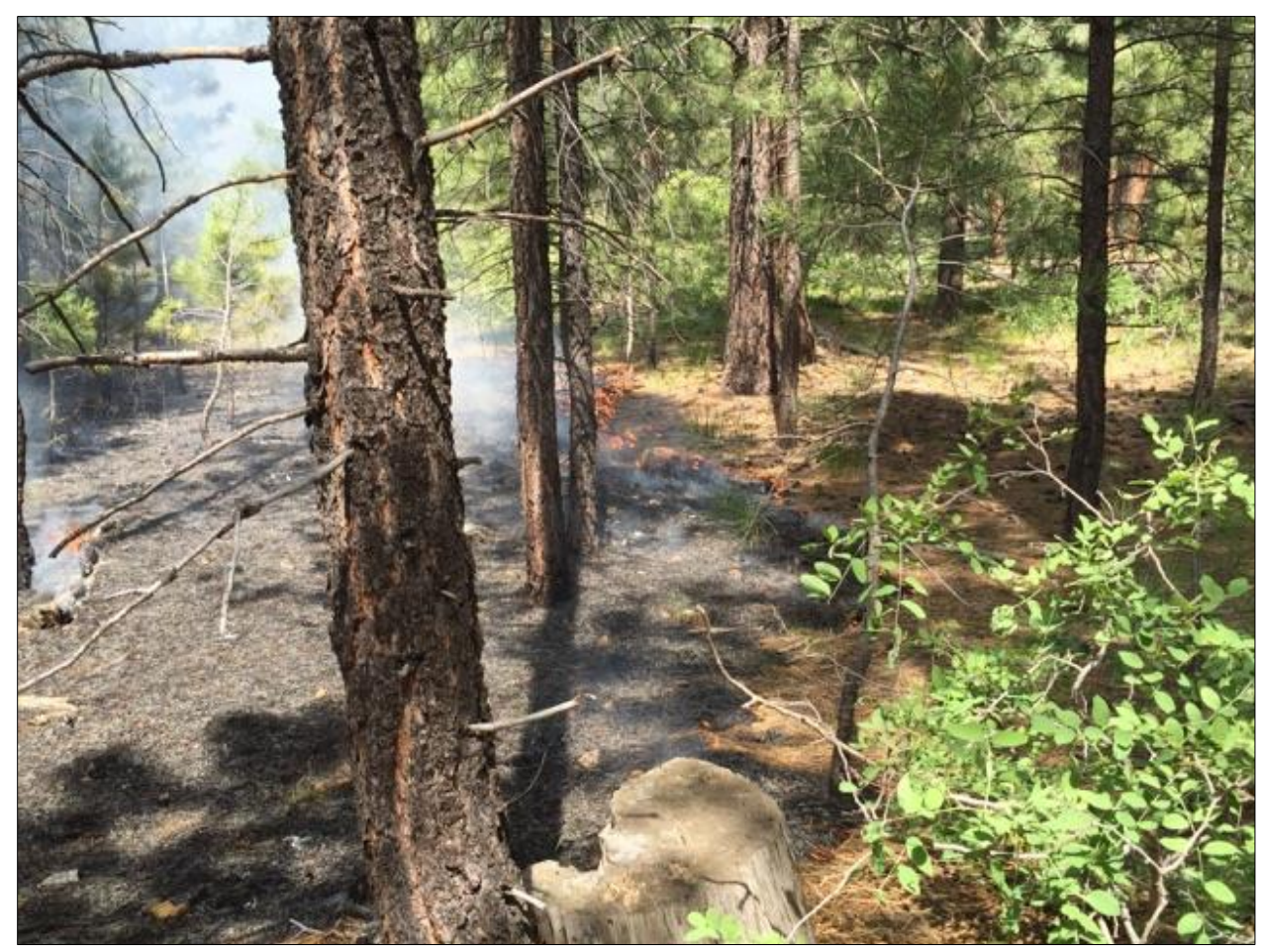
Low intensity Burnt Fire consuming pine litter yesterday, July 7, 2015.