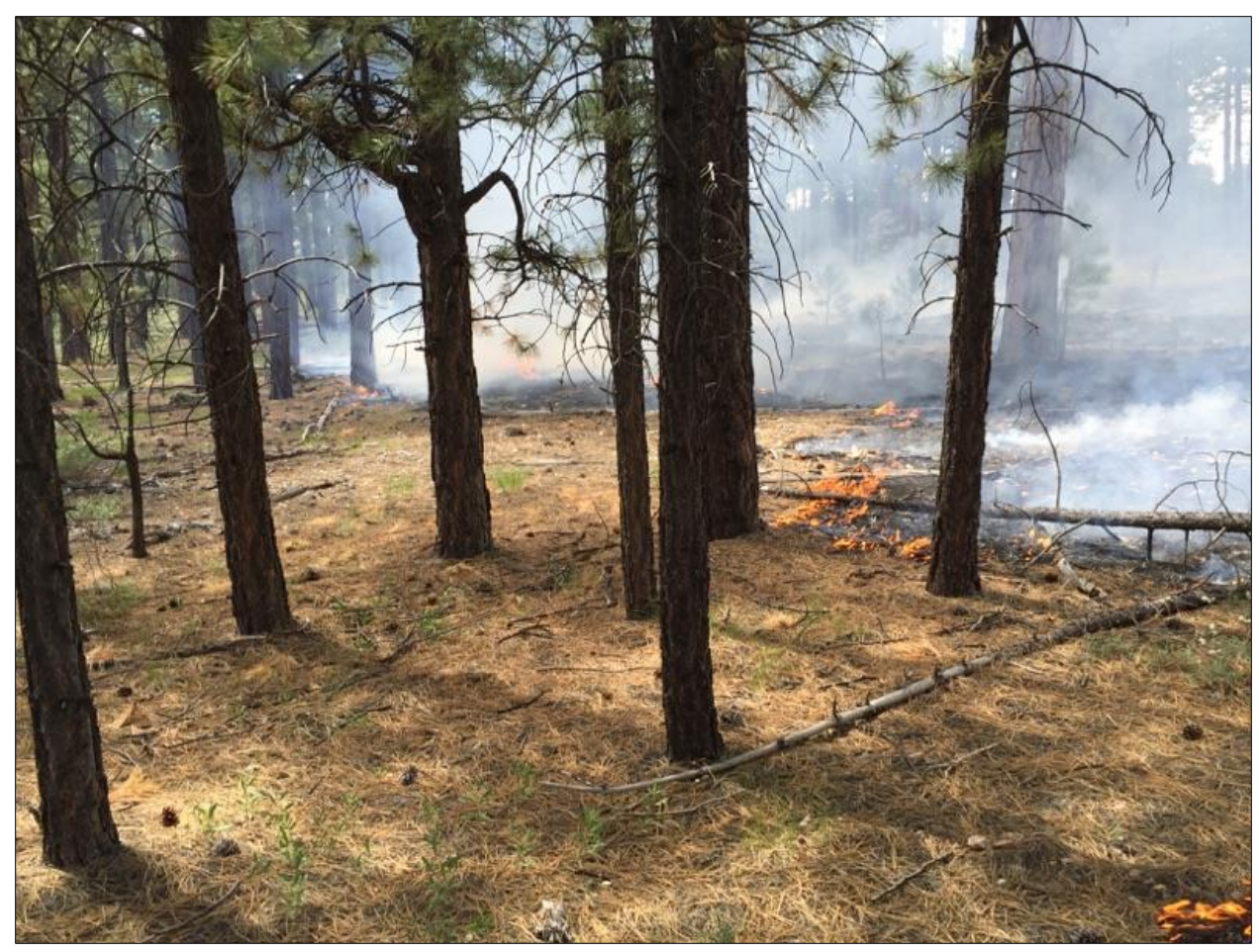
Low intensity Burnt Fire consuming pine litter yesterday, July 7, 2015.