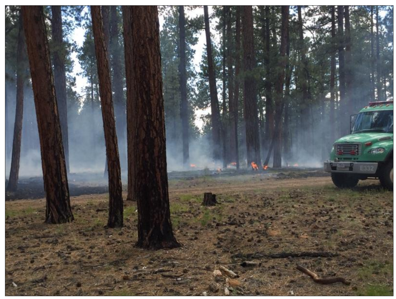
Firefighters patrol the Burnt Fire yesterday, July 7, 2015, in order to assess current conditions and fire behavior.